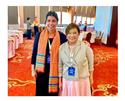
Above: Prevention efforts were presented to over 50 nations at the CMDE Conference for medical and dental missionaries