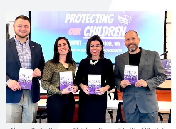
Above: Protecting our Children Summit in West Virginia

REAL TALK debuted in Germany, historically the first country in Europe to open its doors to Playboy, which created a ripple effect of freedom and healing within faith communities and families.