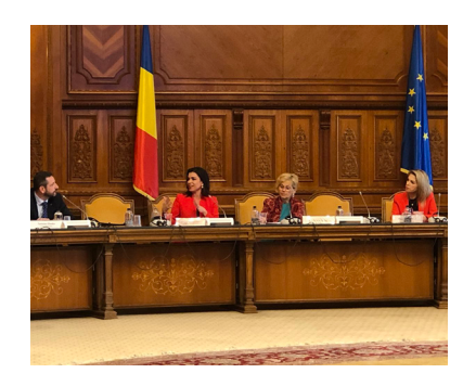
Above: Rozalia Biro, President of Foreign Affairs, at the Parliamentary Palace in Romania