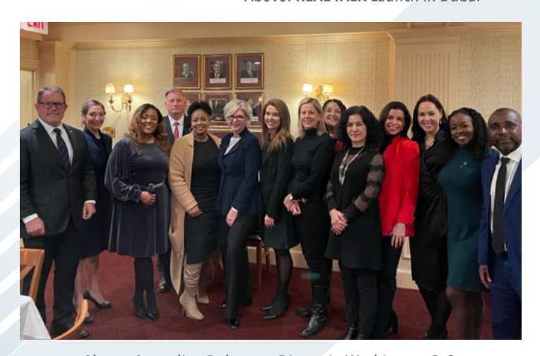
Above: Australian Delegates Dinner in Washington D.C.