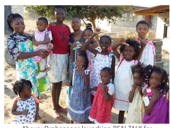
Above: Orphanages launching REAL TALK for Next Gen in Kenya