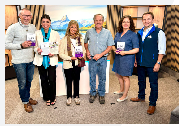
Above: REALTALK highlighted with CBN Germany

REAL TALK is transforming lives by sparking authentic conversations that break shame and secrecy, address root causes, and create lasting healing. A tool like this has not existed before, and breakthroughs are happening around the world in leaders and for children K-12. By empowering individuals to confront trauma and break generational cycles, we protect children from being victimized or becoming consumers of sex, and foster next-level freedom for adults. With transparency and empowerment, REAL TALK helps people reclaim their stories and embrace their purpose.