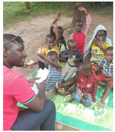
Above: Orphanages launching REALTALK for Next Gen in Uganda

Our work in the orphan space, through REAL TALK and The Interparliamentary Human Trafficking Task Force, is critically important, as orphans represent one of the highest-risk populations for exploitation and trafficking.