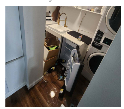
Above and Below: Damage to survivor's business from Hurricane Milton